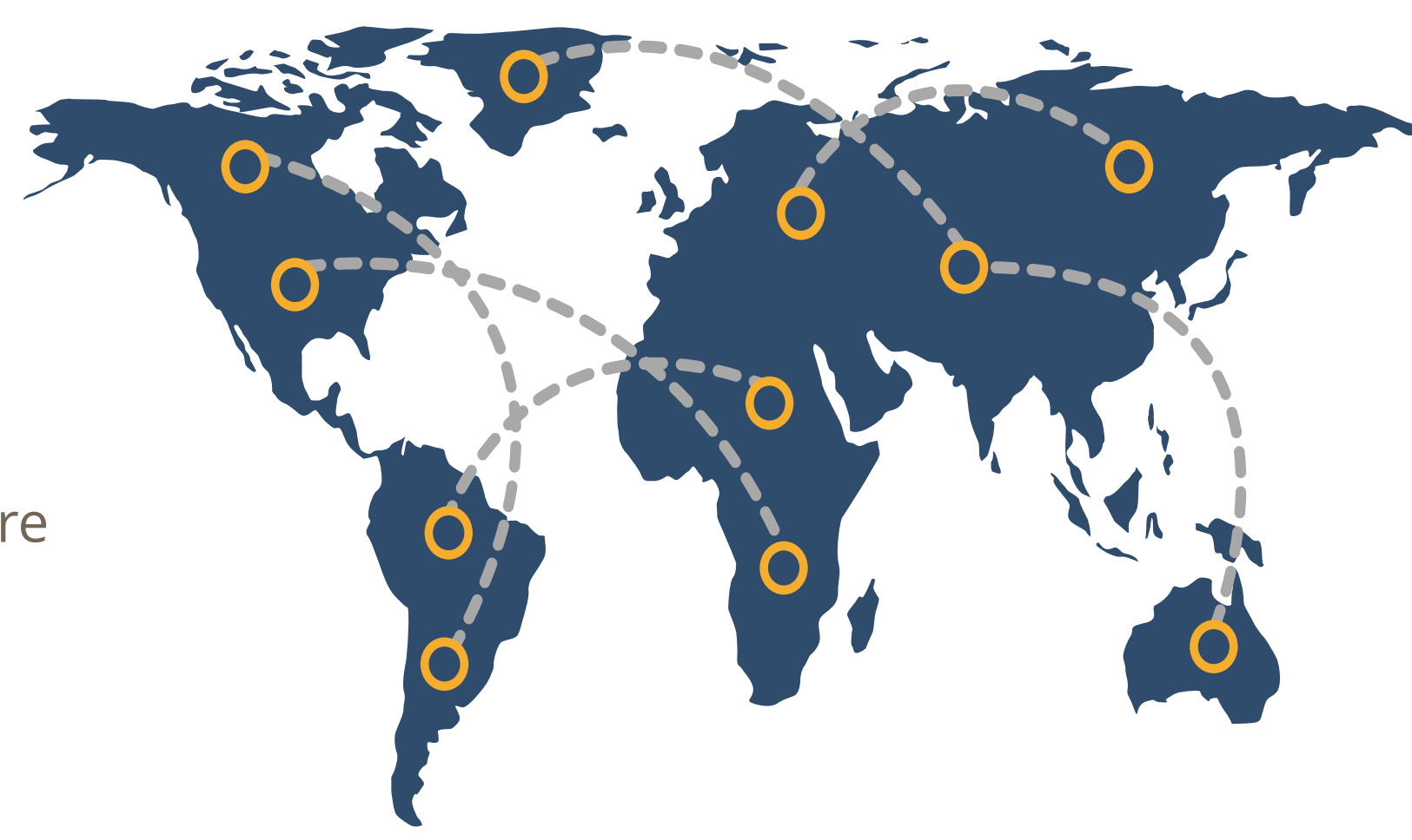
Figure 1. Poland Syndrome Community Registry Growth

The Poland Syndrome Community Register (PSCR) and the CDKL5 Registry are hosted on a flexible, cloud-based centralized platform that upholds regulatory, security, and privacy requirements to support worldwide collaboration. With PSCR, the decision was made to launch a registry that could support participation globally, while remaining compliant with data regulations. The web-based registry was initiated in January 2022, and currently includes 242 participants across 27 countries. After its launch in July 2018, a decision was made with the CDKL5 Registry to expand the web-based registry to nine additional languages in March 2022 to attract participants in non-English speaking countries. The number of countries represented by enrolled participants has grown 50% since the new languages were added, from 22 in March 2022 to 33 currently. Participants in non-English speaking countries represent 87% of participants added to the registry in that same period (see Figure 2).